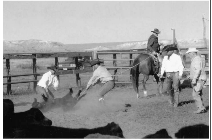
Cattle working and branding is a neighborly affair at Reynolds Cattle Co.

Black admits "self bragging is half scandal." But, in a very humble way, he is willing to share the reasons for Reynolds Cattle Company's success. The right genetics, management, and information exchange can help decrease the risk level in a partnership and replace it with a trailer load of trust. Black concludes, "I think our bulls from Dalebanks are the right way to go. I really do. We're going to continue to go that way. They choose the best bloodlines to infuse into their cowherd, which helps us out. They have a good idea of not only what we're looking for, but what everyone's looking for." Reynolds Cattle has found a trusted partner in Dalebanks. Three generations of decision makers on both sides of the partnership can't be wrong.