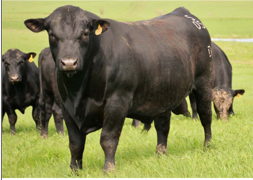
505 on pasture in May. War Party x Promptitude 9506. He sells 11/19/16!

Provided their primary use remains as a selection tool to simultaneously compare two or more animals for multiple traits, there will be little confusion. As with any genetic predictions, we welcome your questions about these important selection tools.