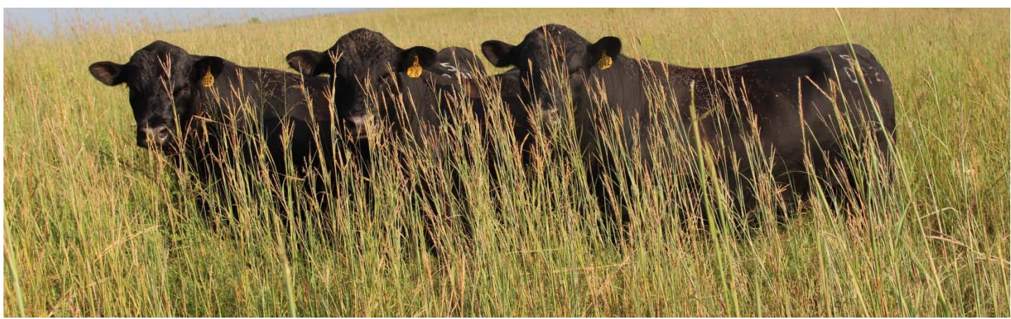
Mother Nature blessed this year's bulls with great grass all summer. It's amazing to see the Flint Hills this green in September!

Dalebanks Angus The Perriers 1021 River RD, Eureka, KS 67045