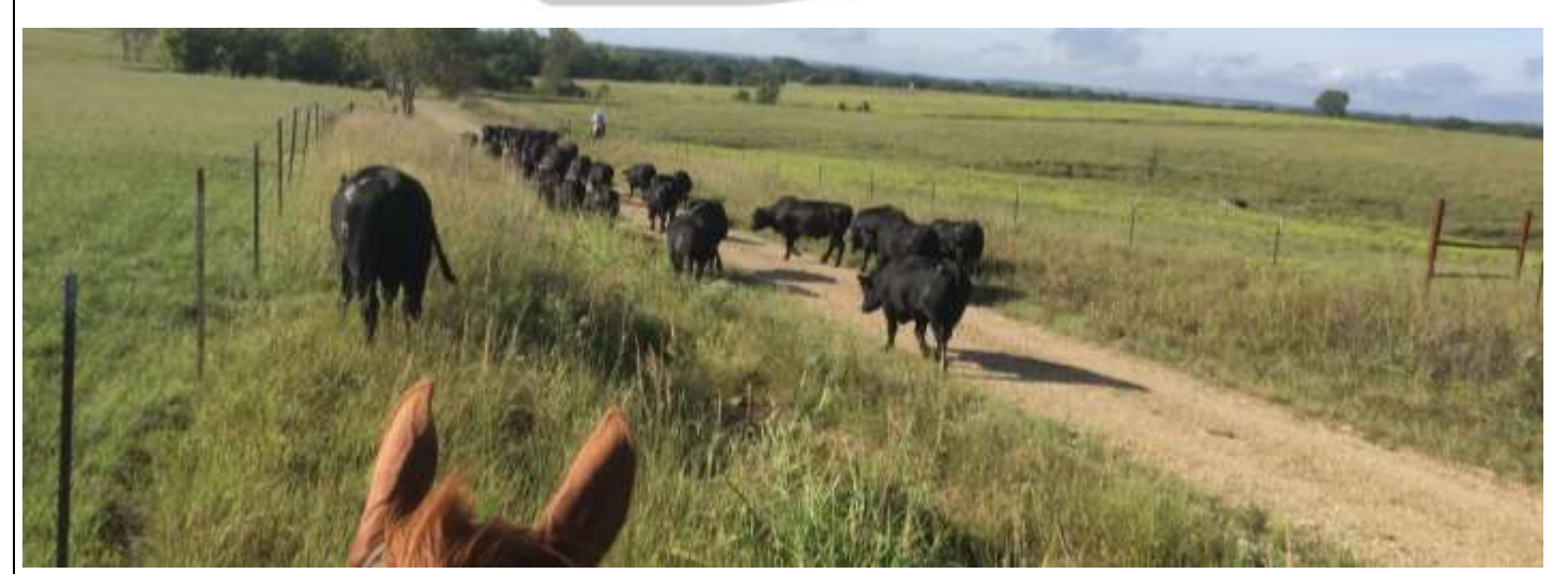
The coming 2-year-old sale bulls on their way back to Headquarters 9/11/15.

Dalebanks Angus The Perriers 1021 River RD, Eureka, KS 67045