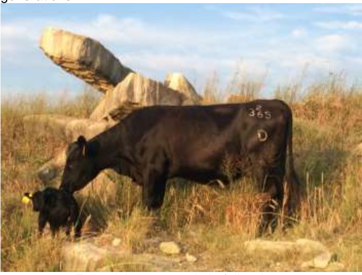
Fall calving season is in full swing.

So don't laugh as I attempt to change my lingo when referencing our livelihood. Regardless of what we call this way of life, I know that all of us will continue to respectfully care for our animals, handle them responsibly and sustain these family-owned businesses for generations.